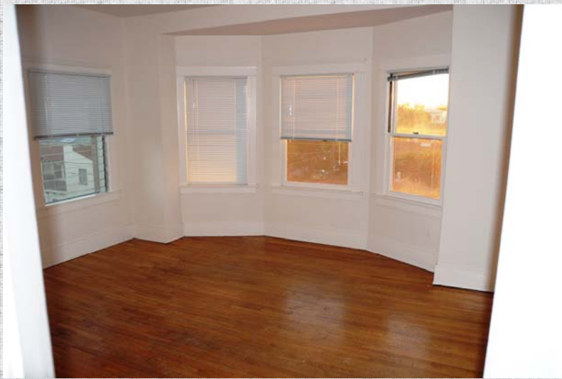
Hardwood floors and a west-facing bay window make the unit very light

This 4th (top) floor single with bathroom and kitchen is available for $1,450 per month.