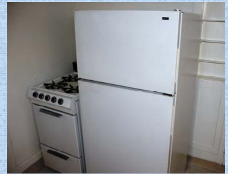
Kitchen includes stove refrigerator and new cabinets. South and east facing windows allow a lot of light into the kitchen.